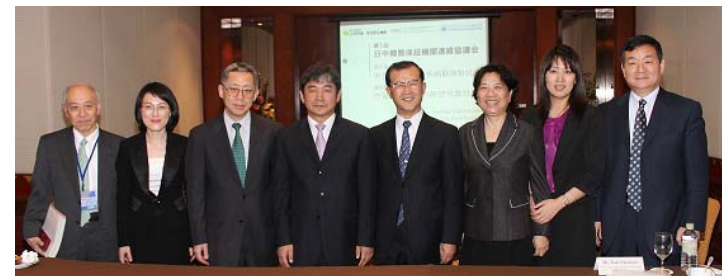
The Inaugural Meeting for Japan-China-Korea Quality Assurance Council (4 March 2010)

Member agencies: NIAD-UE, Higher Education Evaluation Center of the Ministry of Education (HEEC) of China, and Korean Council for University Education (KCUE)