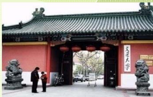
Shanghai Jiao Tong University Koguan Law School