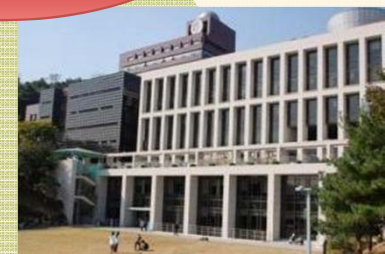
Sungkyunkwan University Law School/School of Social Science