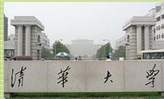
Tsinghua University School of Law