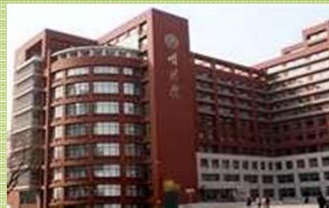
Renmin University of China School of Law