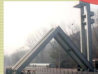
Seoul National University School of Law