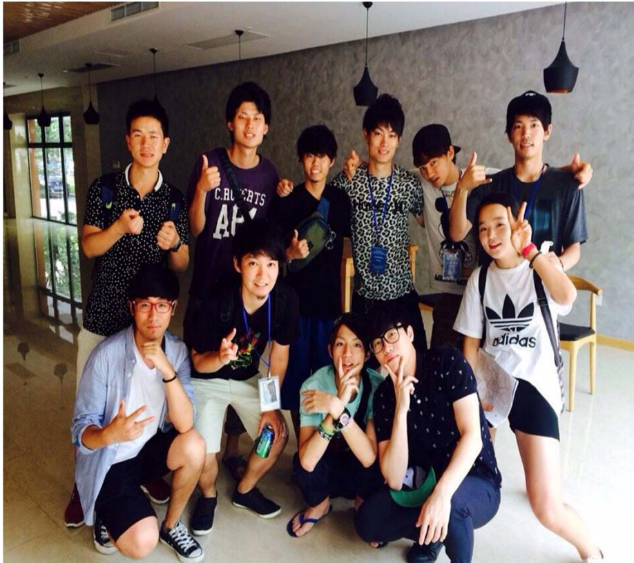
With participating students from KU, PNU and SJTU in Summer School